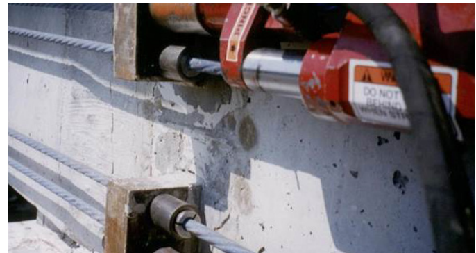
» Member load retrofits » Construction load analysis