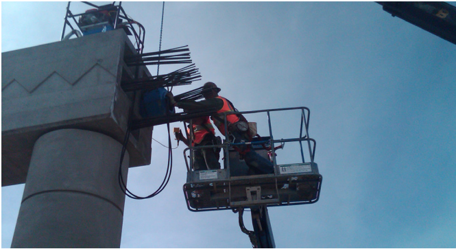
» Post-tensioning design and analysis