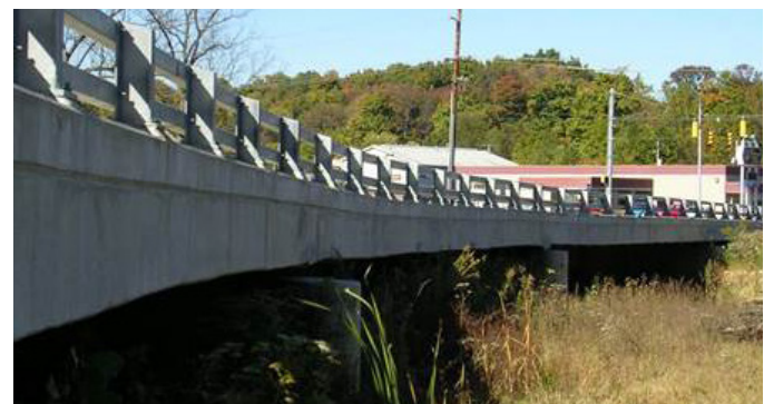
» Long-span PT slabs for minimum vertical clearance