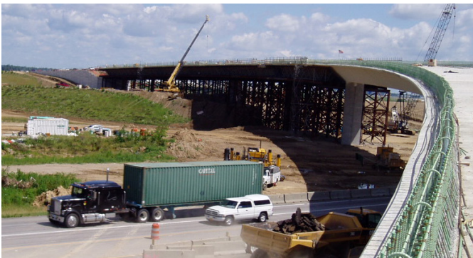
» Post-tensioned concrete box construction engineering