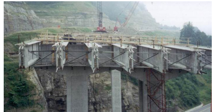
» Construction engineering for spliced concrete bulb-t structures