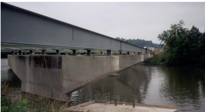
» VE widening of overhangs with PT bars » Elimination of costly cofferdams